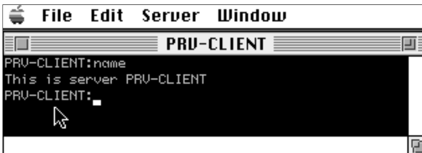
Remote Console application for Mac OS

NetWare and Novell are registered trademarks; IPX, NetWare Client, NetWare Directory Services and NDS are trademarks; and NetWare is a registered service mark of Novell, Inc. Mac OS, PowerPC, AppleTalk, and ARA are registered trademarks of Apple Computer Corporation.