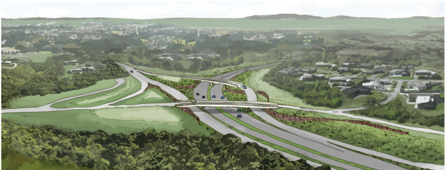
An artist's birds-eye view of the finished interchange.

The road layout has been improved from the design originally designated in 2004. An Alteration to Designation confirming the final design has been issued by Waikato District Council.