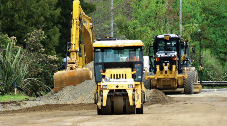
The southbound lane is about to reopen on SH1 at the Tamahere Interchange. A six-week SH1 traffic diversion has been in place to rebuild the lane where it ties in with the new expressway. Four more stages of road construction are planned, but they will be less disruptive to traffic.