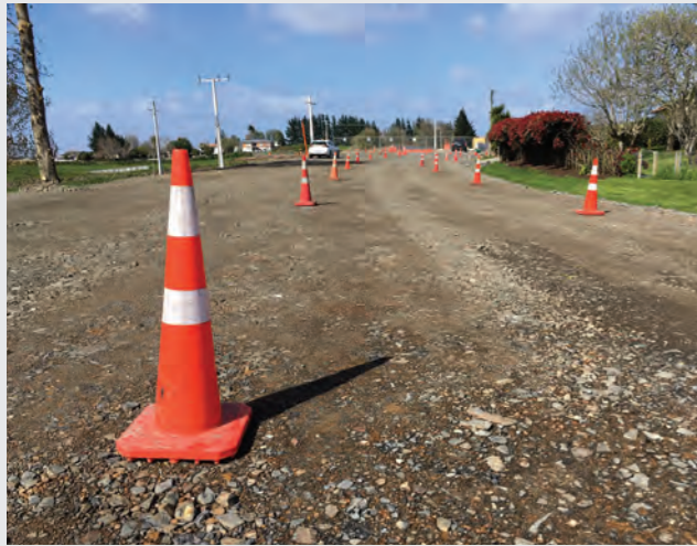
The bridge structure is now complete. Services are being installed under the bridge. The road tie-ins on either side are also under construction. Horsham Downs is expected to reopen in mid-December 2019.