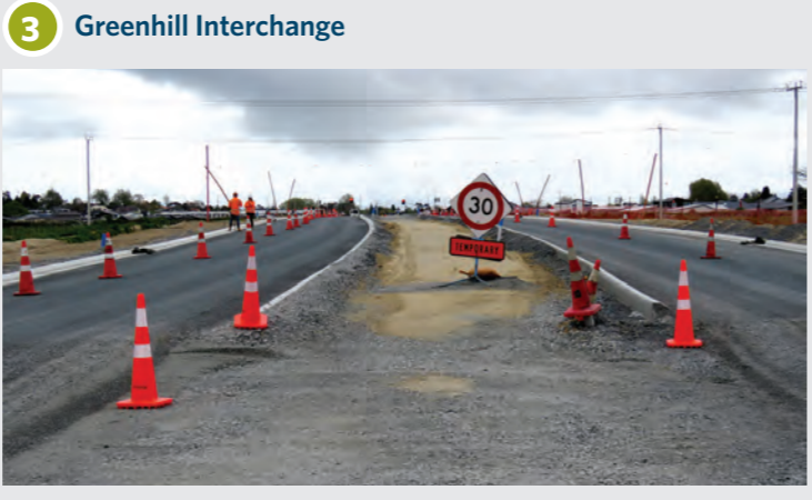
Traffic was transferred on to the new road layout on 7 October. Greenhill Road is now closed where it intersects with the expressway. Fill is being placed over the closed section to complete the expressway ramps. Pardo Boulevard now extends under the expressway and connects with Greenhill Road east of the expressway.