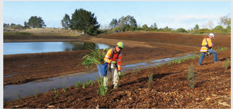
The interchange bridge is completed. The Ruakura Road East connection to Morrinsville Road is also completed. Design for the Ruakura Road West connection to Silverdale Road is currently being developed. Wetlands are now mulched and planted.