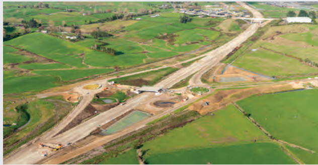
The bridge deck is now complete, barriers installed and concrete walking/cycling paths are under construction.