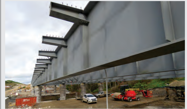
The steel bridge structure is complete. Construction of the concrete deck is about to begin.