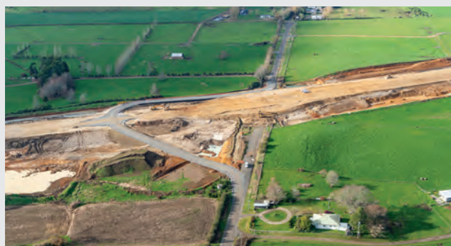
The ramps to take the expressway over the Powell's Road underpass are now settling. Once settlement targets have been achieved, the site for the box culvert underpass will be excavated, and ground strengthening can begin to prevent the soils around the underpass liquefying in an earthquake. Construction of the box culvert will follow.