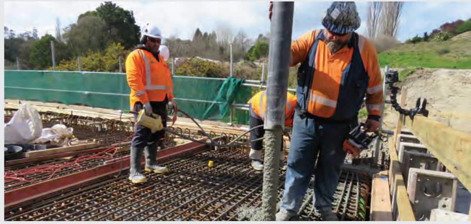
Construction of the end walls, wing walls, settlement slabs and barriers is now well advanced.