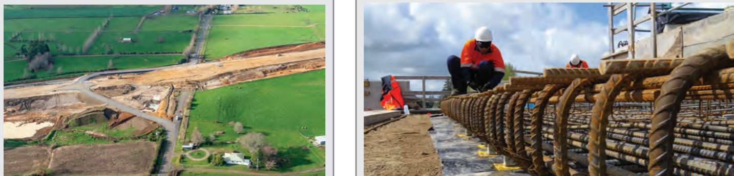
Construction has resumed on the bridge that crosses the East Coast Main Trunk rail line and Ruakura Road. This bridge was constructed to a point where it could provide access over the rail and road by dump trucks hauling sand to build expressway embankments. Construction of the bridge walls, settlement slabs and barriers has now resumed.