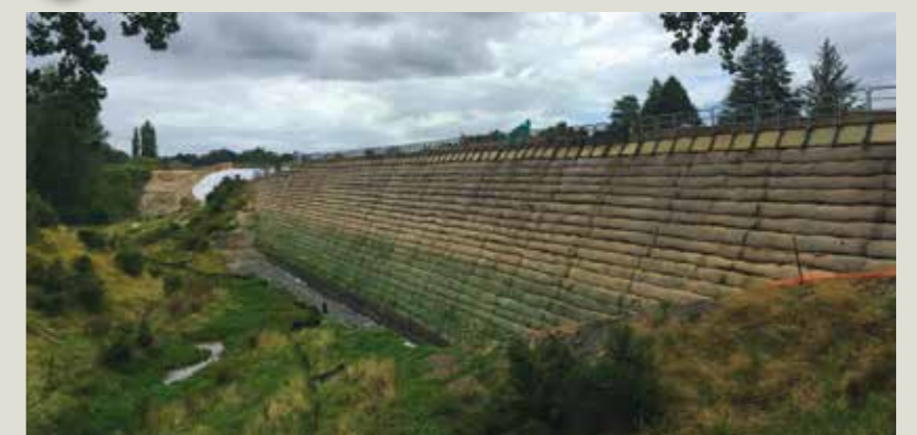
The southern section of the 16m-high retaining wall in the gully west of SH1 Cambridge Road is complete. Construction of the northern section is under way. The sand stockpile near SH1 is being used to build this wall. The concrete deck has now been poured on the East West Link Bridge, and excavation for the Cambridge Road Bridge is complete.