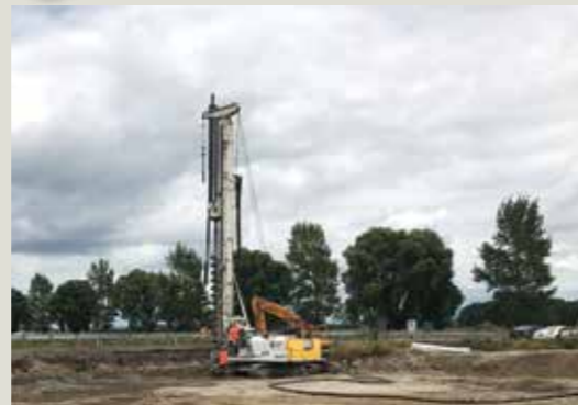
Ground improvements are under way to strengthen the ground where the bridge will take the expressway over Puketaha Road. This protects the bridge foundations from earthquake damage.