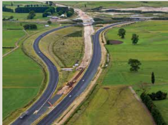
We're building the tie-in between the Hamilton section and the Ngaruawahia section. When the project opens in 2020, the Hamilton section lanes (SH1) will have priority at the merge.