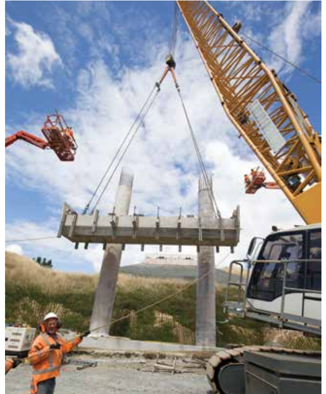
Going up - ropes attached to each end of the crosshead give the construction crew full control during the lift.

Once Kay Road reopens Horsham Downs Road will be closed near the intersection with Borman Road (near the old chocolate factory) so construction can begin on the bridge that will take Horsham Downs Road across the expressway. The terrain in this area will not allow room for a traffic diversion and service relocations so Horsham Downs Road will be closed for approximately eight months.