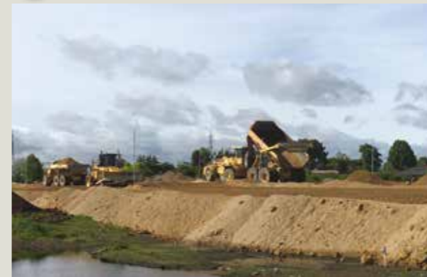
Finishing work on the bridge is on hold while dumptrucks move sand north over the bridge to complete the earthworks haul road and build expressway embankments through to Puketaha Road.