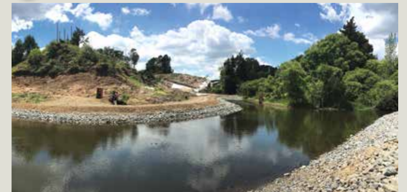
Rock armour has been placed along the stream banks where they will pass under the gully bridges. This will protect the bridges from flood damage. Ground improvements have also begun here.