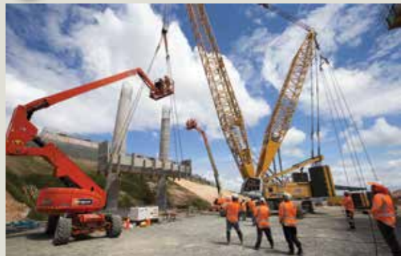
The crossheads and all 21 bridge beams were lifted into place on the Kay Road Bridge in late January. Preparation is under way for the concrete deck pour, and construction of the back walls at each end of the bridge, followed by bridge barrier installation.