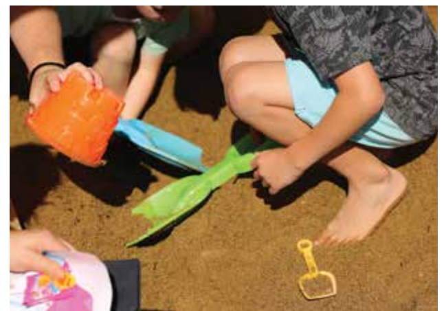
Our Open Day - a great event for the whole family.

There will be a sandpit for the kids, a small digger to play on, plus prizes and giveaways. Save the date and we'll see you there.