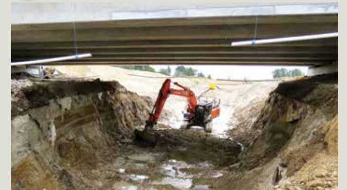
The Morrinsville Road Bridge is open to traffic. Our earthworks team is excavating the expressway under the bridge. This will allow dumptrucks to haul sand and soil north and south without disrupting traffic.