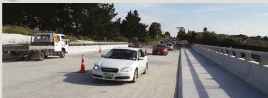
Gordonton Road Bridge is open to traffic. Our earthworks team is preparing to excavate the expressway under the bridge.