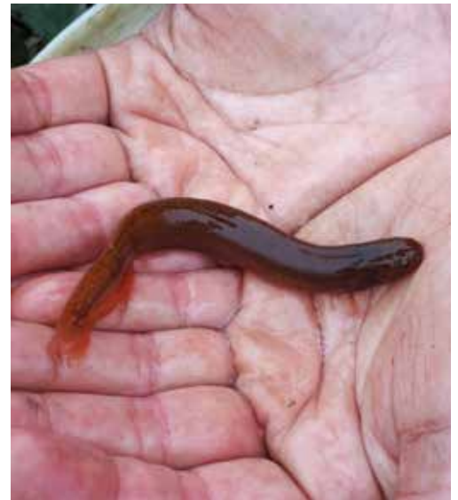
One of the black mudfish which was relocated downstream.

The mudfish is unique among native fish, being able to slow its metabolism to survive in mud when streams dry up, then revive when the water returns.