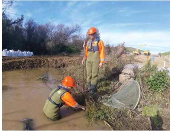
Fishing in the Mangaonua Stream