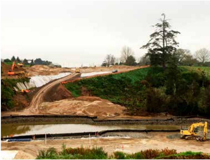
A view from the south side of the gully