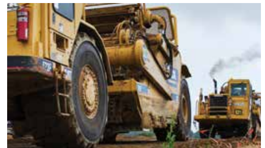
Getting ready for Season 2 earthworks

Haul routes under newly constructed bridges such as at Gordonton Road, Morrinsville Road and Matangi Road help set up for a successful earthworks season. This will enable the project to minimise the amount of earthworks equipment on the local roads.