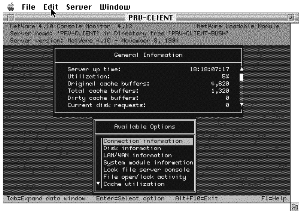
Figure 3. The Remote Console enables administrators to manage the network from a Mac OS workstation.

A Remote Console application is included with the NetWare Client for Mac OS to enable administrators to back up the server, load and unload NLMs, install other applications and change configuration parameters from a Mac OS computer. The remote console application can open windows to multiple servers so administrators can easily view the console of two or more servers simultaneously. This makes compare settings among servers easy.